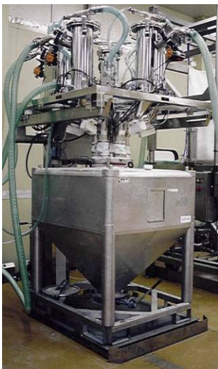
Figures: left: central transfer- and dosing station including 5 PTS connected to a container positioned on a scale. below: Central transfer and dosing station fixed on the support frame.