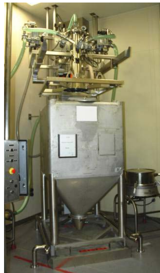
Figures: Left/below: Central transfer- and dosing station including a PTS with 3 product entries fixed on a frame which can be lowered on a container positioned on a scale.